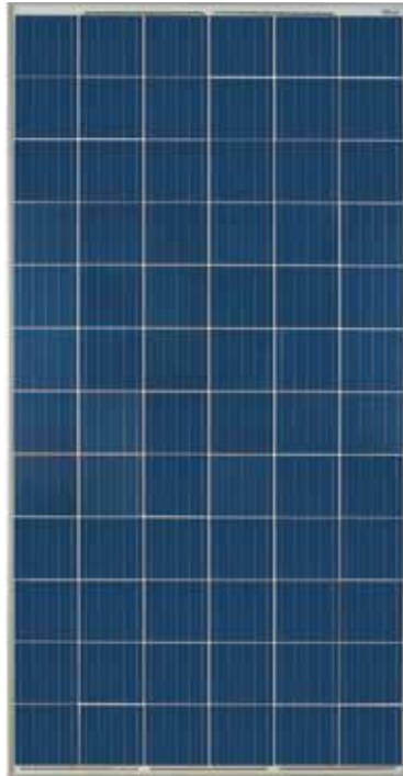
AC Module Front view

* Proprietary technology owned by ENPHASE Inc.