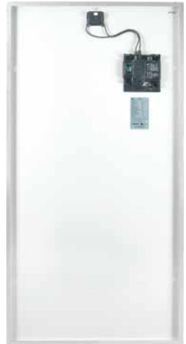
AC Module Back view